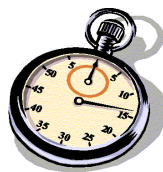
Will you be able to beat the clock?

events. The more we have at these types of tests the better as referees can then drag each other round the test. Good luck to everyone who does take the test!