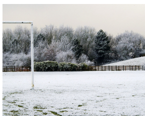
The above scene is being seen more and more around our area at the moment